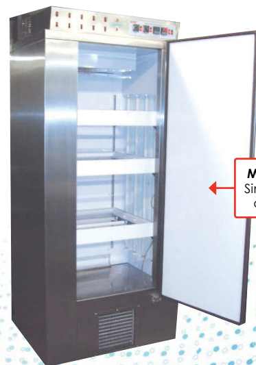
Model ICC50-SL\WL Single door with wall and shelf lighting.

Serving the Scientific, Medical and Research industries since 1945