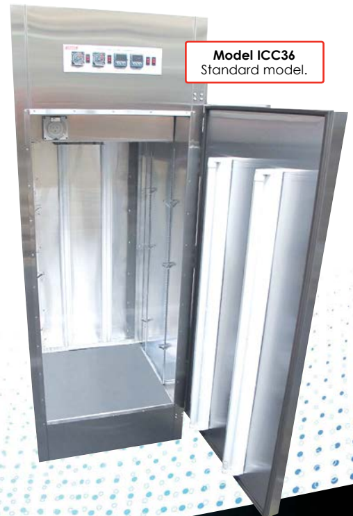
Model ICC36 Standard model.

Controller – With Labec Refrigerated Cycling Incubators, environmental conditions can be accurately reproduced and controlled with our dynamic air flow system and unique heating system. They provide excellent temperature uniformity using a digital microprocessor based PID temperature controller which controls the temperature within the range 5°C Lights OFF / 10°C Lights ON up to +50°C and Day/Night simulation features.