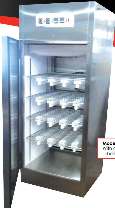
Model ICC50 With optional shelf lights.