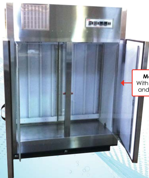
Model ICC120 With rear wall lights and white interior.