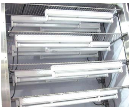
Incubator with optional shelf lighting.

When optioned the controller can be connected via RS232/RS485 communication ports which can be connected directly to a data logger or computer to log chamber information. Software is available for programming and monitoring.