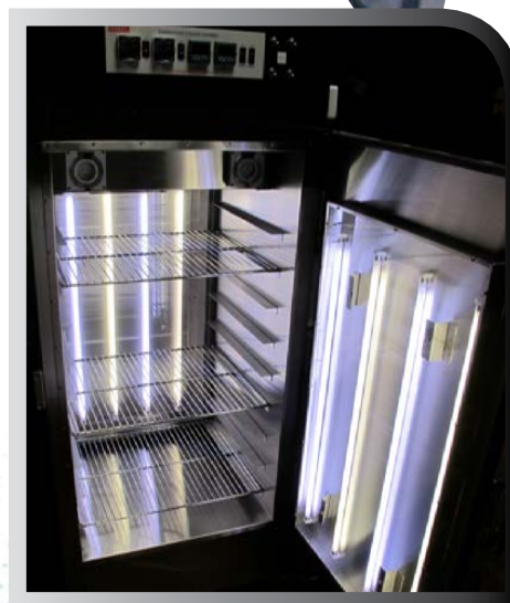
Incubator with a mixture of T5 Aquastar and Marinestar light banks.

Additional options – To suit your requirements the addition of options such as safety toughened glass viewing window for easy viewing, programmable controllers, timers and cable access ports are also available.