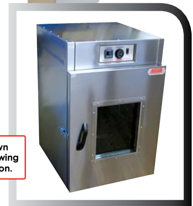
Model shown with glass viewing window option.

Controller – A digital microprocessor based PID temperature controller controls the temperature within the range ambient +5°C to 200°C, temperature fluctuation at 105°C is \pm 1^\circ\text{C} .