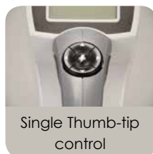
Single Thumb-tip control