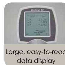
Large, easy-to-read data display