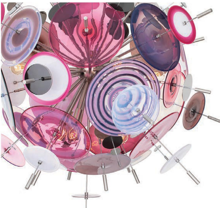
Custom Palette Fushia, rose, Topaz, mocha, opaline and white hand blown glass with Pewter, satin black Nickel and polished Stainless Steel discs.