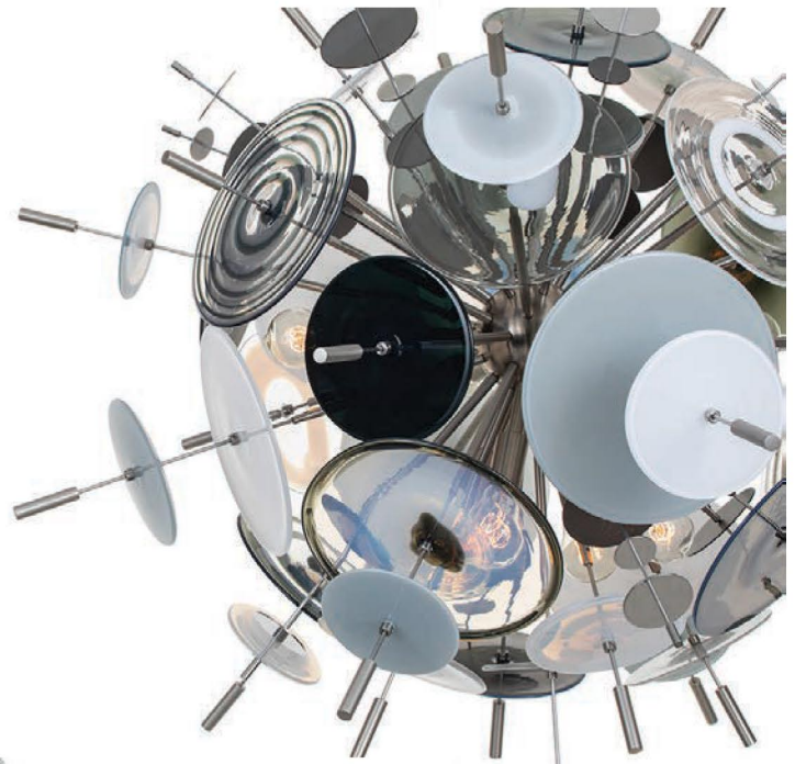
Black & White Black, light grey, smoke, white and opaline hand blown glass with black satin Nickel and polished Stainless Steel discs.