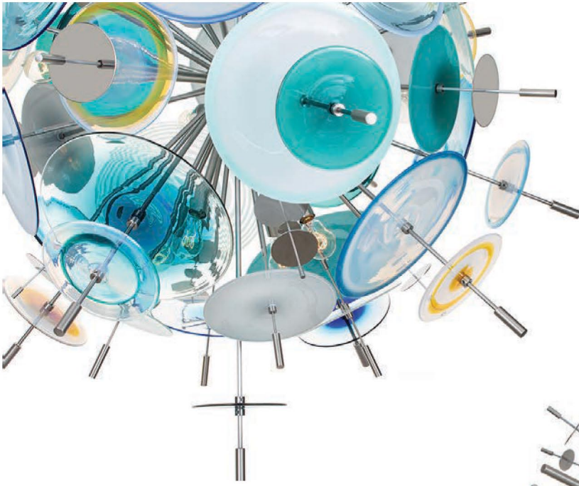
Ultramarine and Amber Ultramarine, Turquoise, emerald, aqua, white, opaline, and amber hand blown glass with polished Stainless Steel discs.