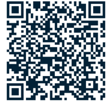
Table Maintenance Log