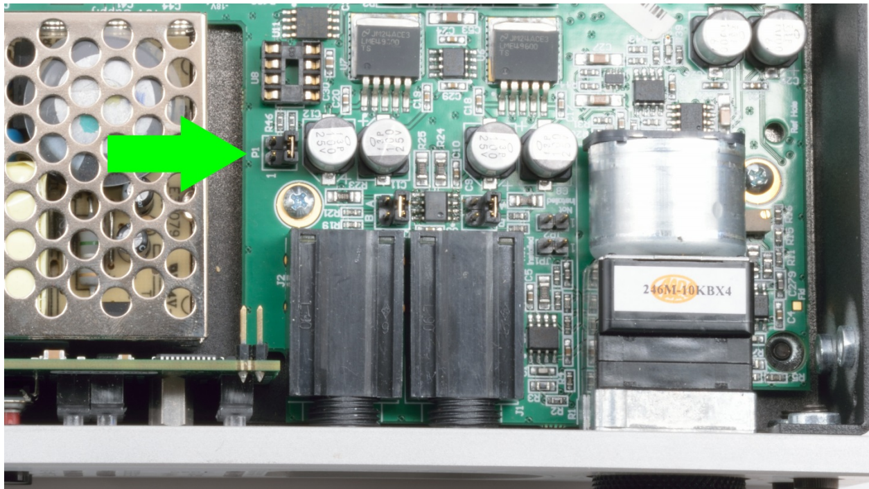
Figure 2 - On the main board, move jumper on P1 to this position.