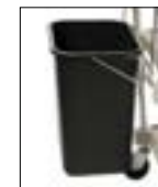
Wastebasket and Holder