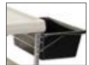
Utility Bin and Holder