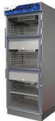
TWC243078-G-4B 4" base (4B) standard for this model

Approximate Capacity 62 Blankets or 90 Solution Bottles (1 Liter Each)*