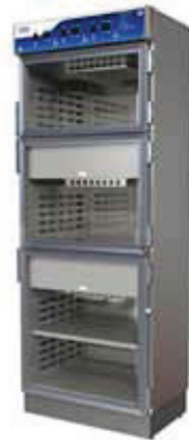
TWC183078-G-4B 4" base (4B) standard for this model

Approximate Capacity 62 Blankets or 54 Solution Bottles (1 Liter Each)*