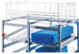
B36-V Top basket