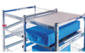
PSCAP-V Stainless dust cover