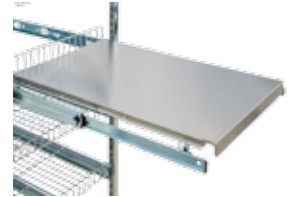
TU1620CVR-V Stainless steel cover for wire shelf