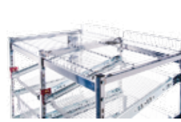
BTO-V Wire top shelf