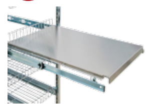
TU1620CVR-V Stainless steel cover for wire shelf