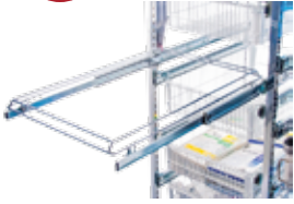
SLFR-V Frame for trays