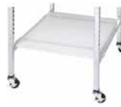
INSERT-V Dust shield