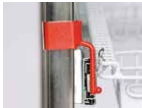
REDSTOP Safety stop