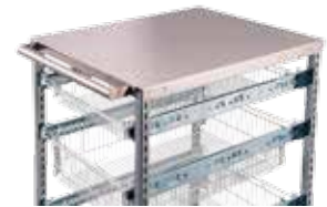
TOP-SINGLE-H-V Stainless steel top with push handle