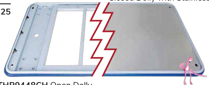
THP9448CH Open Dolly