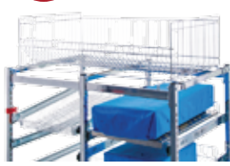
B36-V Top basket