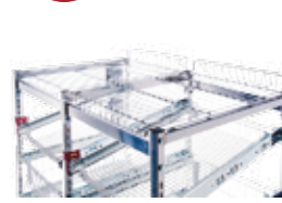
BTO-V Wire top shelf