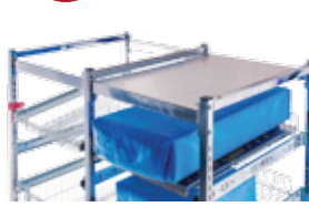
PSCAP-V Stainless dust cover