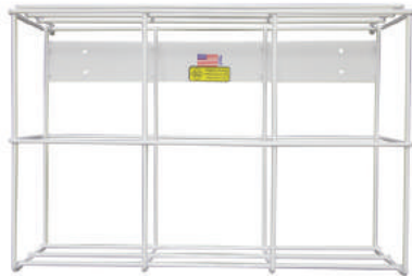
Triple Bottle Holder

Available in 1 gallon and 3 liter capacities