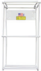
Single Bottle Holder

Hardware included for easy wall mounting