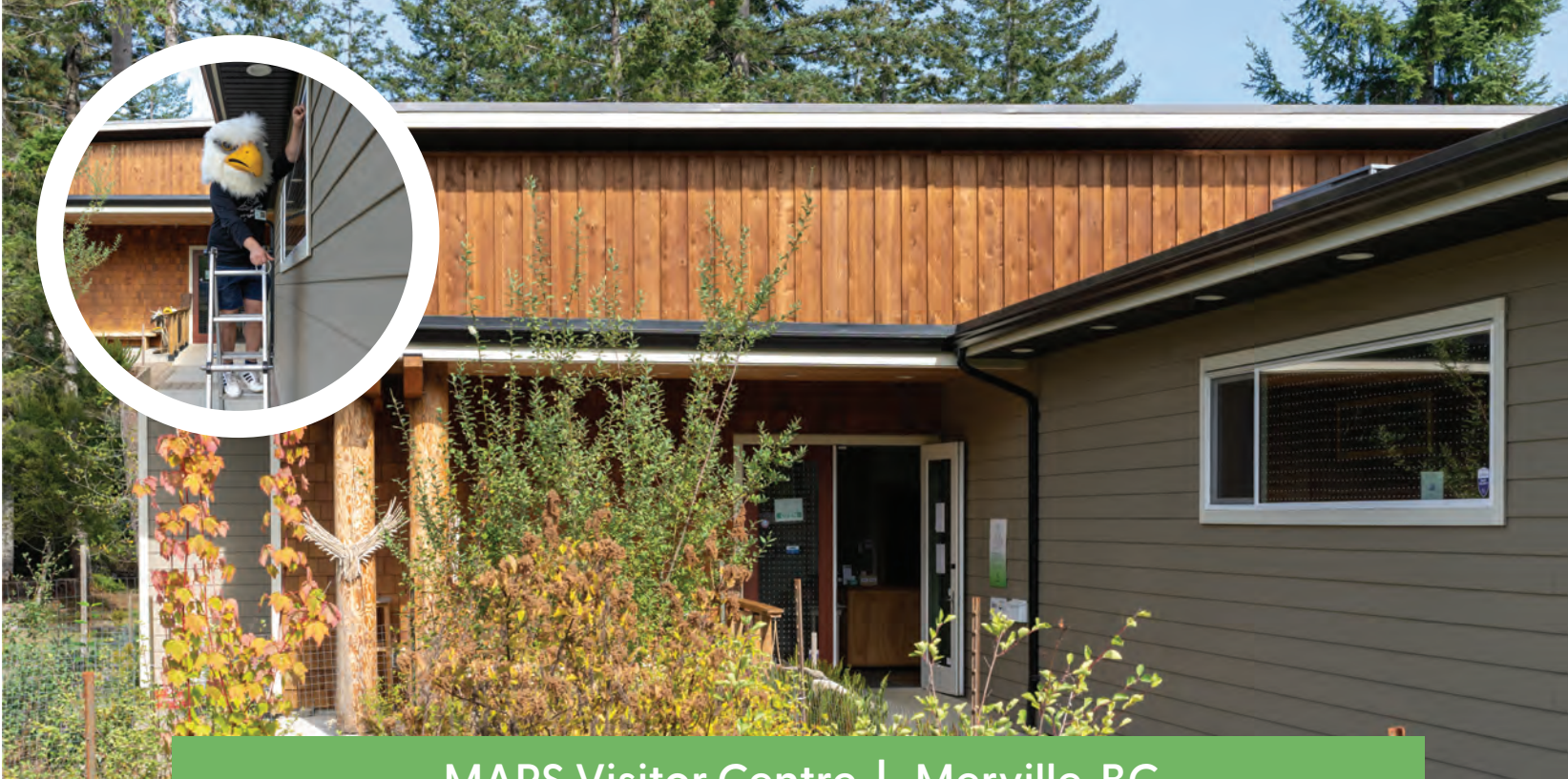
MARS Visitor Centre | Merville, BC