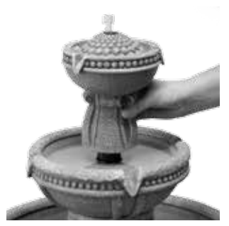
Step 3: Put the Two Birds Finial over the top of the extension tube. Be careful to keep the tube centered in the hole at the top of the Two Birds Finial.