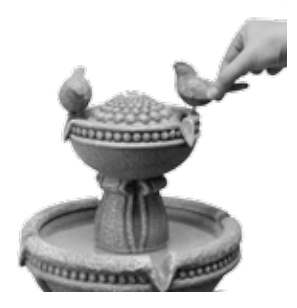
Step 6: Align the pegs on the bottom of the two birds to the small holes on the rim of the bowl and insert to attach the birds.