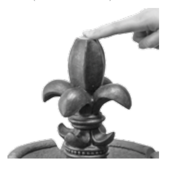
Step 6: Press the extension tube down until it is level with the Fleur de Lis Finial.