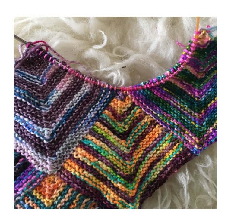
Row #41 – sl 1 st, k2tog, psso, fasten off

Next row - sl 1st st, knit to the end Row #1- sl 1st st, k19, sl 1, k2tog, psso, k20 (WS rows) - sl 1st stitch, knit to end Row #3- sl 1<sup>st</sup> st, k18, sl 1, k2tog, psso, k19 Row #5- sl 1st st, k17, sl 1, k2tog, psso, k18 Row #7- sl 1st st, k16, sl 1, k2tog, psso, k17 Row #9- sl 1st st, k15, sl 1, k2tog, psso, k16 Row #11- sl 1st st, k14, sl 1, k2tog, psso, k15 Row #13- sl 1st st, k13, sl 1, k2tog, psso, k14 Row #15- sl 1st st, k12, sl 1, k2tog, psso, k13 Row #17- sl 1st st, k11, sl 1, k2tog, psso, k12 Row #19- sl 1st st, k10, sl 1, k2tog, psso, k11 Row #21- sl 1st st, k9, sl 1, k2tog, psso, k10 Row #23- sl 1st st, k8, sl 1, k2tog, psso, k9 Row #25- sl 1st st, k7, sl 1, k2tog, psso, k8 Row #27- sl 1st st, k6, sl 1, k2tog, psso, k7 Row #29- sl 1<sup>st</sup> st, k5, sl 1, k2tog, psso, k6 Row #31 – sl 1st st, k4, sl1, k2tog, psso, k5 Row #33- sl 1st st, k3, sl 1, k2tog, psso, k4 Row #35 – sl 1st st, k2, sl 1, k2tog, psso, k3 Row #37 – sl 1<sup>st</sup> st, k1, sl 1, k2tog, psso, k2 Row #39 – sl 1st st, sl 1, k2tog, psso, k1