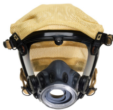
AV-2000 Kevlar Head Harness