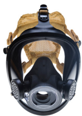
AV-3000 SureSeal Kevlar® Head Harness