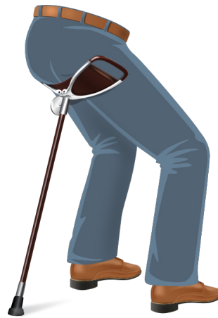
Hammock Style Seat

Note: Use on soft ground requires a special tip. (Not available for some models)