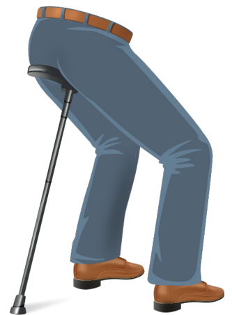
Molded Bicycle Style Seat