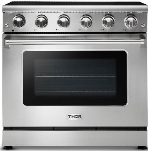
Product: 36 Inch Professional Electric Range in Stainless Steel Model Number: HRE3601