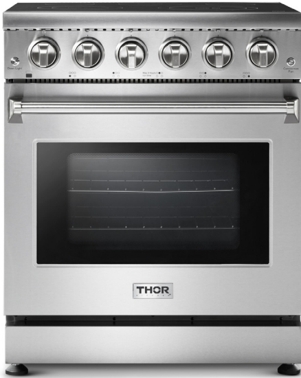
Product: 30 Inch Professional Electric Range in Stainless Steel Model Number: HRE3001