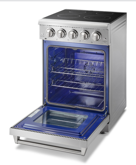
LIMITED WARRANTY: 24 MONTHS ON PARTS AND LABOR