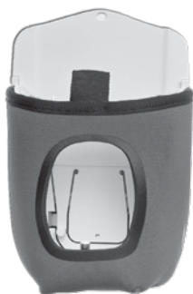
PowerShell with Neoprene Sleeve