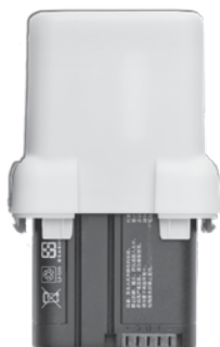
Extended Life Battery with Shuttle