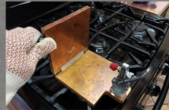
FIGURE 3 While wearing gloves, lift handle and open the top plate.