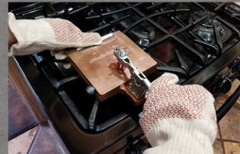
FIGURE 5 Wearing BOTH gloves, close top plate and apply clamp until it clicks. Leave material clamped for 8- 10 seconds. USING GLOVES, unclamp and open top plate. Remove the parchment envelope immediately so as not to burn or overheat your material.