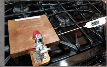
FIGURE 2 Insert digital thermometer shaft into the hole opposite of handle. When desired temperature is achieved, turn the flame/heat off.