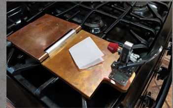
FIGURE 4 Place material in parchment paper onto the bottom plate.