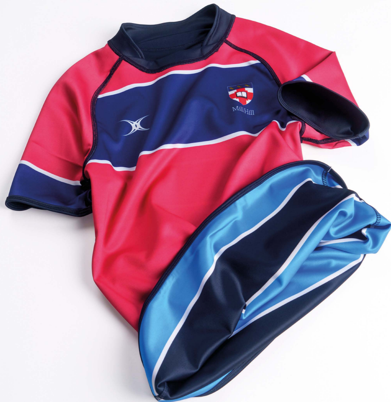
Our hugely popular reversible performance multi-sport shirt