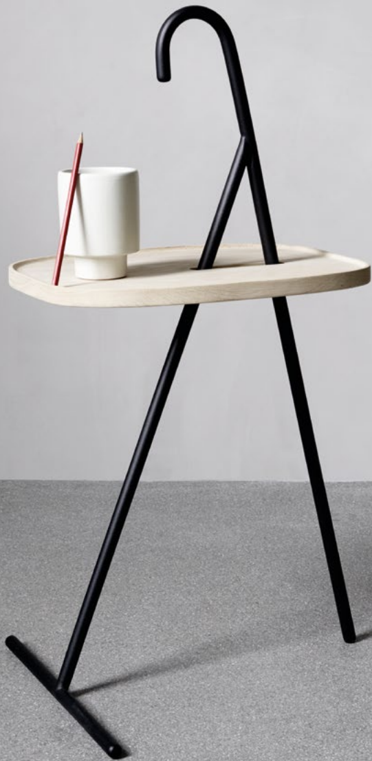
DESIGN NATHAN YONG

HANDY. FROM POINT TO POINT WITH A SUGGESTIVE WALKING STICK HANDLE.