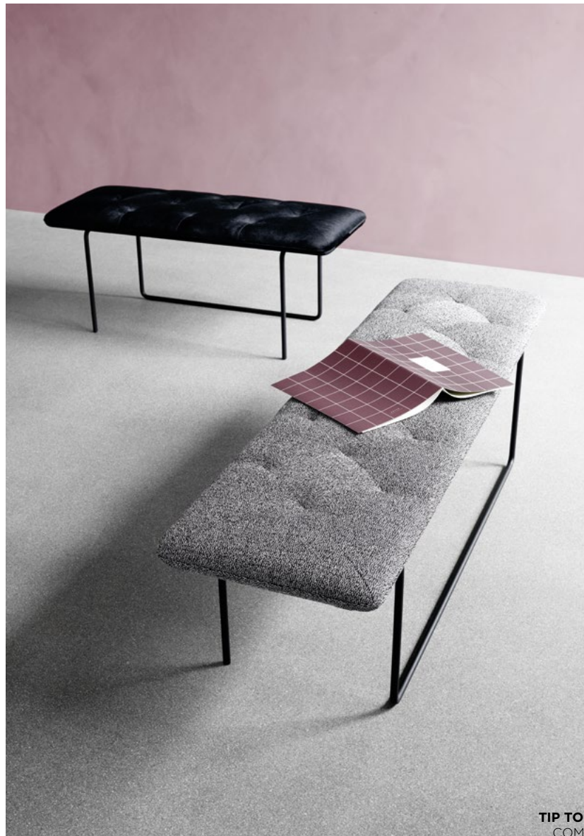
TIP TOE BENCH. GRAPHIC SHAPES FORM A COMFORTABLE SEAT ON SLENDER LEGS.

TAKING SMALL STEPS INTO PURE MINIMALISTIC BLISS.