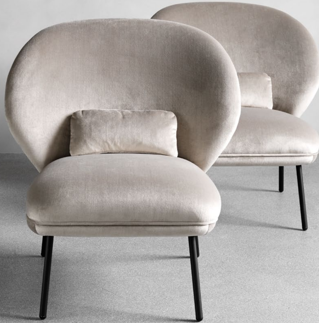
VENTALL. INSPIRED BY TRADITIONAL WICKER FANS, A LOUNGE CHAIR WHOSE MOST DISTINCTIVE FEATURE IS ITS WIDE BACKREST, CURVED IN SEVERAL SENSES.