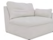
Right Arm Corner