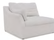
Left Arm Corner