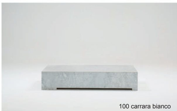
100 carrara bianco