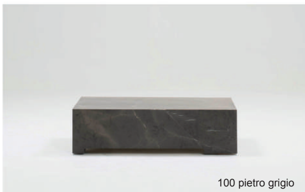
100 pietra grigio