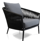
1 seater 850w x 860d x 760h C-MOT-IS-001