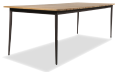
dining table 2000 2000w x 1000d x 750h C-MOT-DT-001