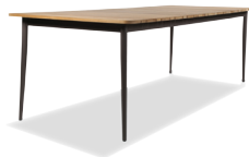
dining table 2400 2400w x 1000d x 750h C-MOT-DT-002