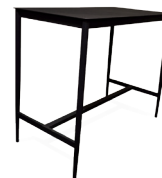
bar leaner 1350w x 700d x 1100h C-MOT-BL-001