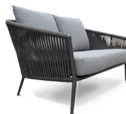
2 seater 1460w x 860d x 760h C-MOT-2S-001