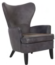
Mentor in Destroyed Black