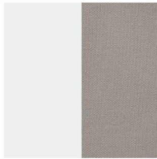
WHITE & GREY