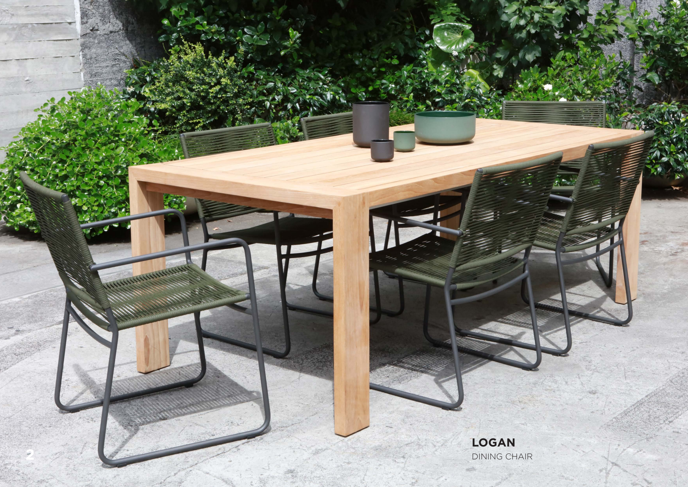
LOGAN DINING CHAIR