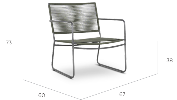
LOGAN Lounge Chair Graphite rope in deep olive green, Wenge aluminium frame