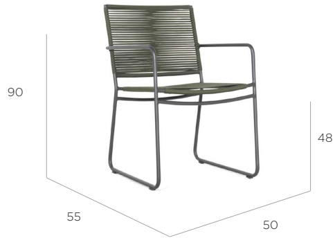
LOGAN Dining Chair Graphite rope in deep olive green, Wenge aluminium frame