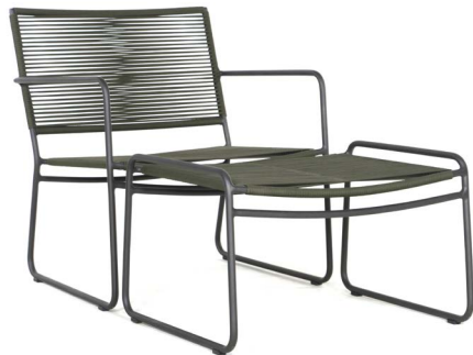
LOGAN Lounge chair and footstool setting