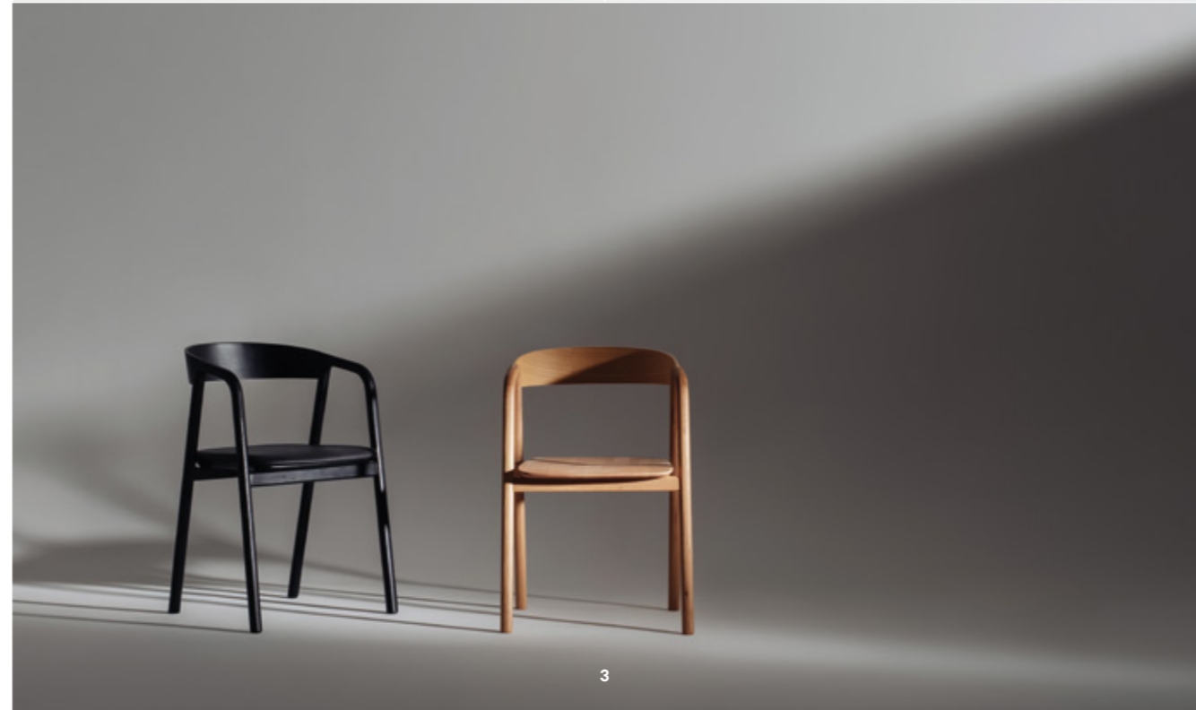
Inlay chair # 519-1201 (wood) # 519-1202 (upholstery)