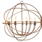
Gyro Large Pendant

L: 40.6" / 103 cm W: 40.6" / 103 cm H: 42.9" / 109 cm