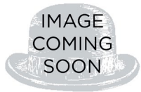
Gyro XS Pendant

L: 17.9" / 46 cm W: 18.5" / 47 cm H: 21.3" / 54 cm