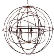
Double Gyro Pendant

L: 40.6" / 103 cm W: 40.6" / 103 cm H: 42.9" / 109 cm