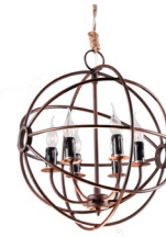
Gyro Small Pendant

L: 32.3" / 82 cm W: 32.3" / 82 cm H: 35" / 89 cm