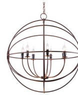
Gyro Medium Pendant

L: 40.6" / 103 cm W: 40.6" / 103 cm H: 42.9" / 109 cm