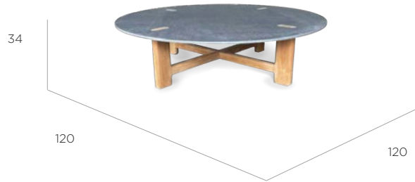
ROUND COFFEE TABLE Teak/Ceramic