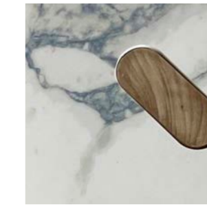
Arabescato natural ceramic