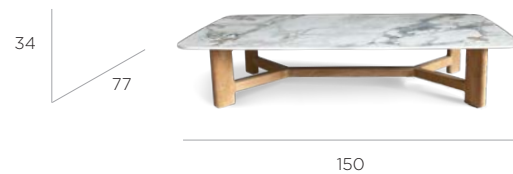
RECTANGLE COFFEE TABLE Teak/Ceramic