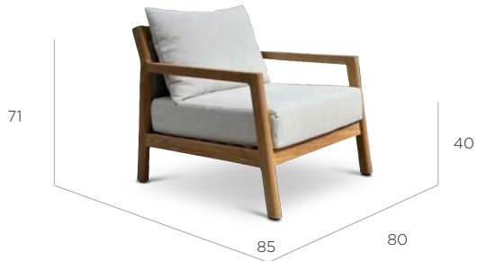
LOUNGE CHAIR Ateja sunproof southend 130/ Teak