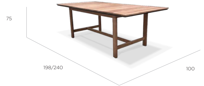
DINING TABLE Teak