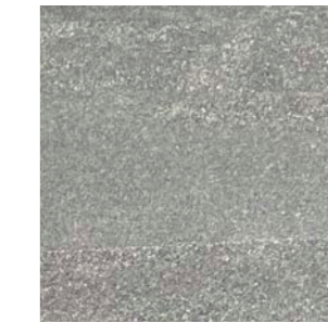
Basalt black ceramic