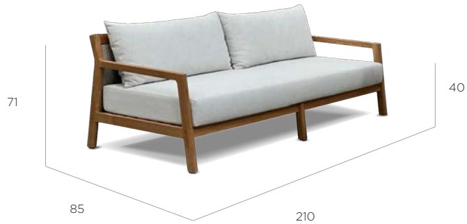
3 SEATER SOFA Shown in Ateja sunproof south- end 130/Teak