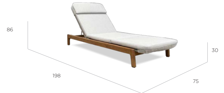
LOUNGER Shown in Ateja sunproof south- end 130/Teak