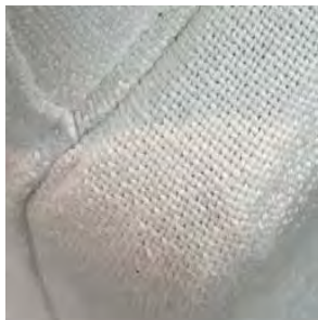
Asa Ivory 00012