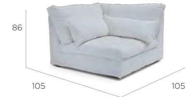
ATOLL Modular corner :summer ivory fabric