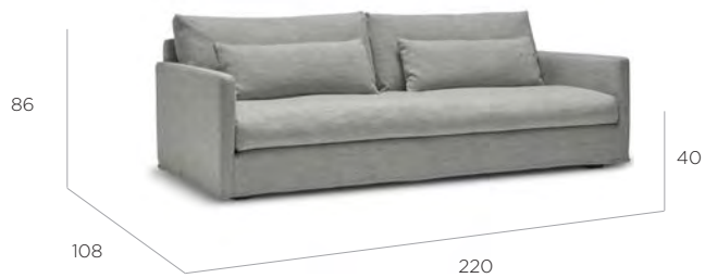
ATOLL 220 :westlake diamond fabric