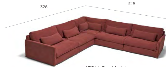
ATOLL 5pc Modular :asa cinnamon fabric