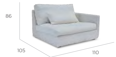
ATOLL Modular RAF :summer ivory fabric