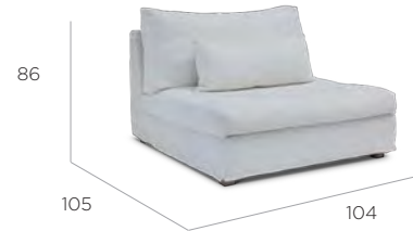
ATOLL Modular armless :summer ivory fabric