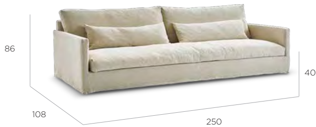
ATOLL 250 :asa bone fabric