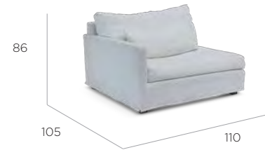
ATOLL Modular LAF :summer ivory fabric