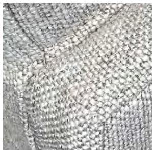
West lake diamond 127-04