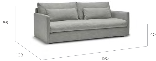
ATOLL 190 :westlake diamond fabric