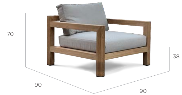
1 seater lounge chair