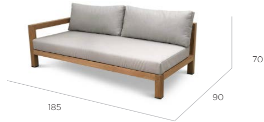
2 seater LAF open end