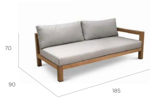
2 seater RAF open end