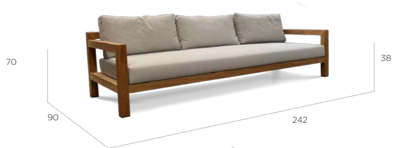
3 seater sofa