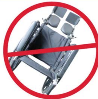
Incorrect curb approach