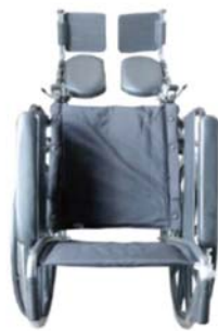
Correct curb approach