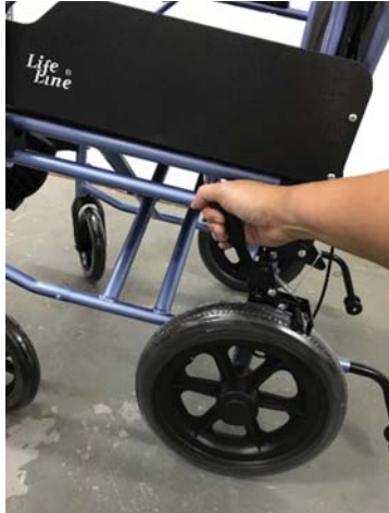
Pull to lock brakes