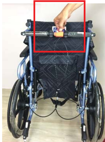
Fold chair by pulling up the knob and press down the bar.