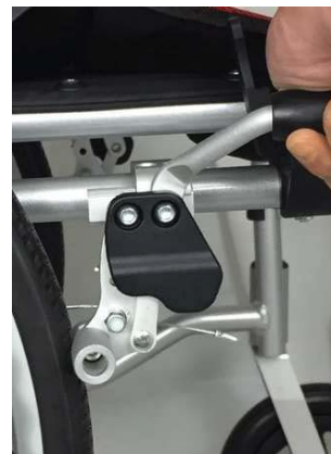
Push to lock brakes.