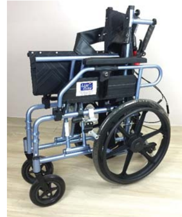
To fold, pull up the seat upholstery.