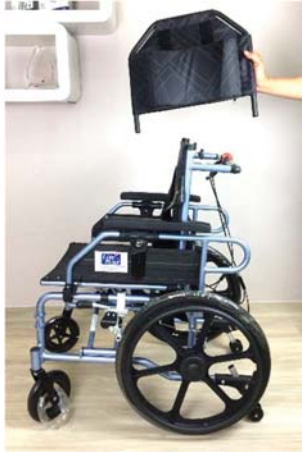
Remove head rest.