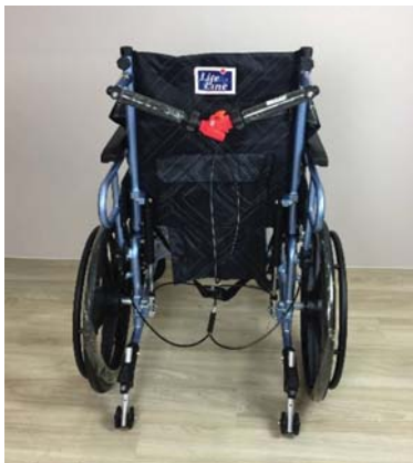
Left Lever: Squeeze to recline.