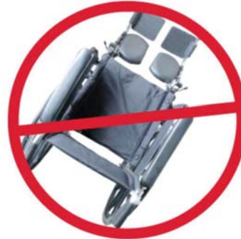
Incorrect curb approach