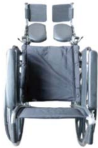
Correct curb approach