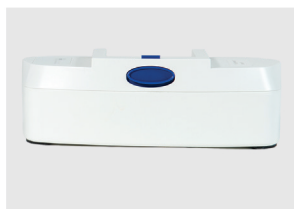
16-CELL BATTERY PACK