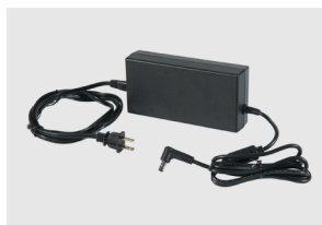
AC POWER SUPPLY (ALL CORDS INCLUDED)