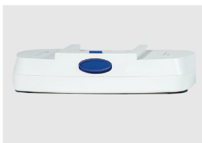
8-CELL BATTERY PACK