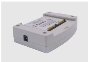
DESKTOP BATTERY PACK CHARGER (OPTIONAL)