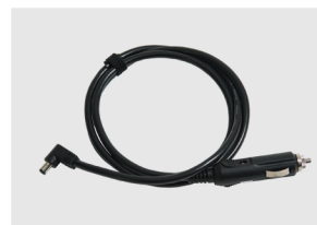
DC POWER CORD