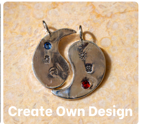
Create Own Design

Perfect for a delicate touch, this small oval pendant can be stamped on both sides or textured with a hammered look.