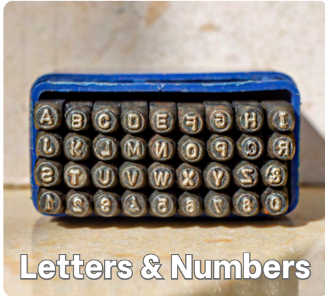
Letters & Numbers