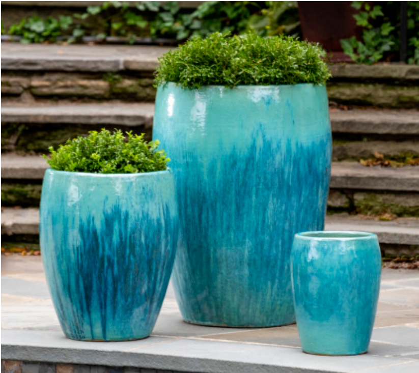
Shown in Antigua