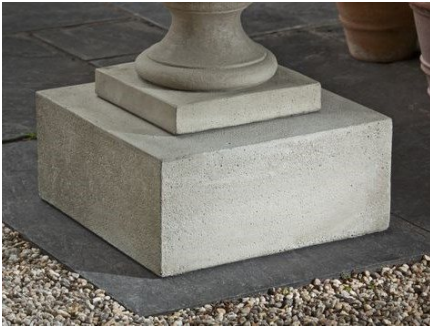
Shown in Verde (VE)