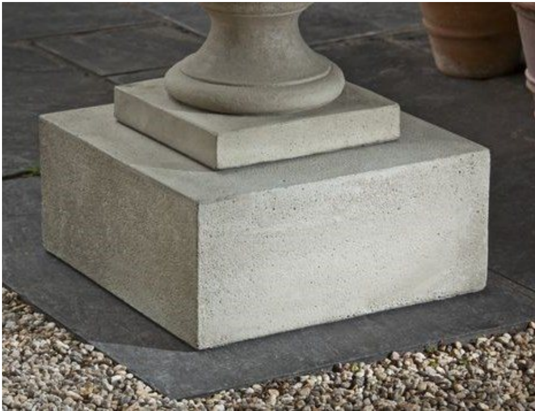
TEXTURED LOW SQUARE PEDESTAL