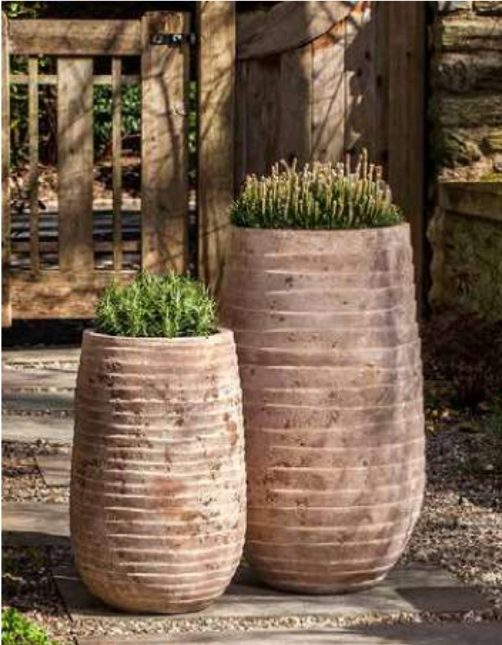
Shown in Antico Terra Cotta