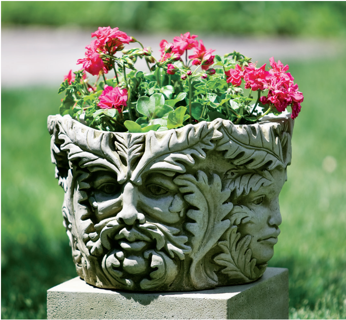
Shown in English Moss