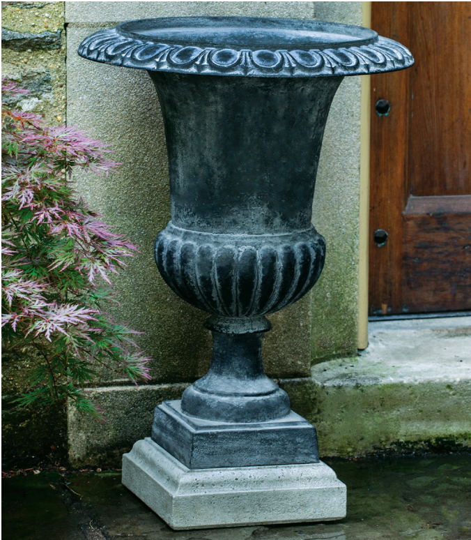
PD-201 shown in Alpine Stone