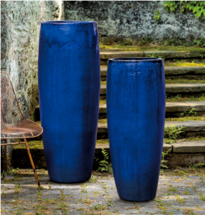
Shown in Sapphire