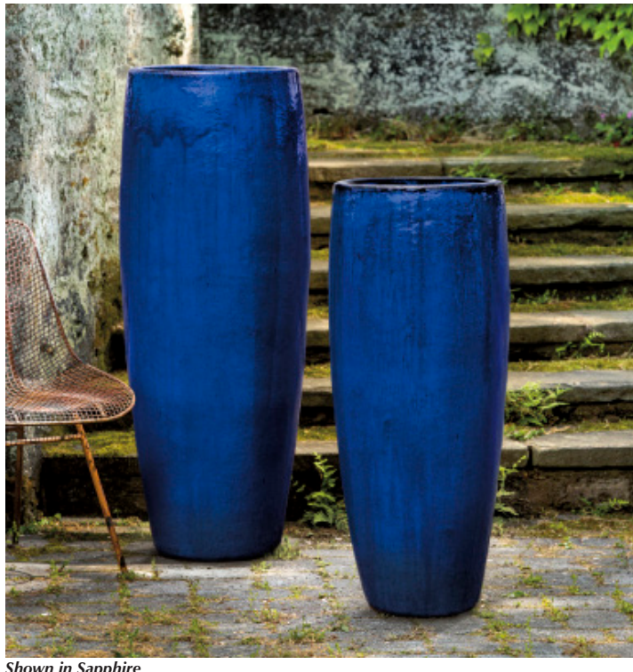
Shown in Sapphire