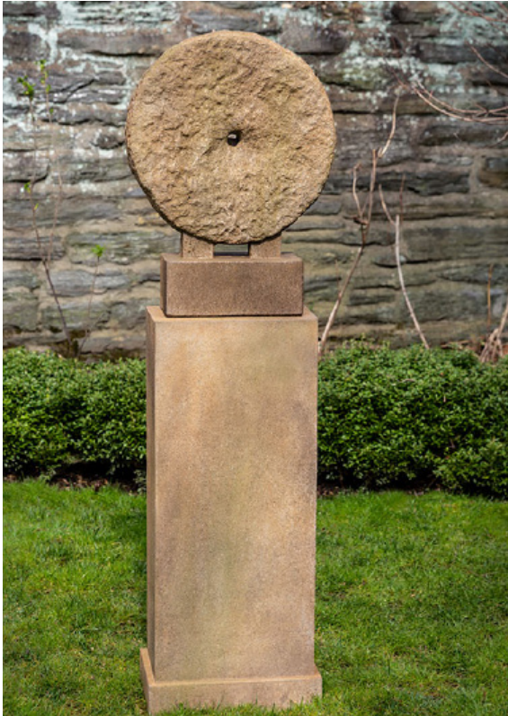
Shown in Aged Limestone on PD-223 Rectangular Tall Pedestal