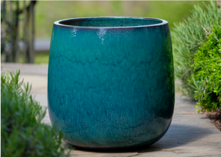
Shown in Indigo Rain