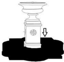
FT-29C/30D (579 lbs) 45"L x 045"W x 011"H

Step 4 - Use a GFCI Outlet: Use only a GFCI outlet when running a fountain.