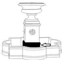
FT-29B/30C (52 lbs) 12"L x 12"W x 8"H

Step 5 - Place the pump cover (FT-29B/30C) over the pump. Ensure it is placed properly and leveled.