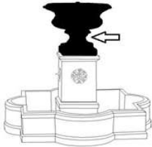
FT-30A (134 lbs) 18"L x 18"W x 21"H

Step 10 - Center the urn (FT-30A) over the column (FT-30B).