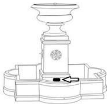
FT-29BB/30CC (4 lbs) 5"L x 1"W x 5"H

Step 12 - Fit the Spout Assembly over the centered pipe inside the urn.