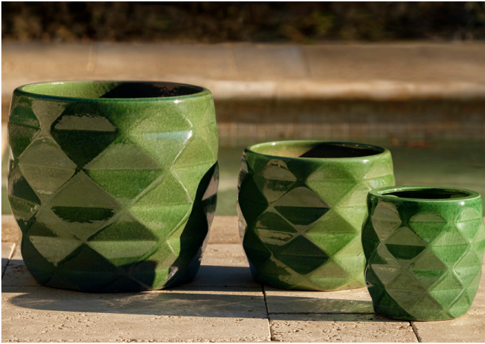
Shown in Holly